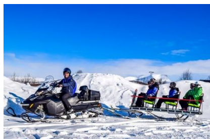
Private snowmobile with group